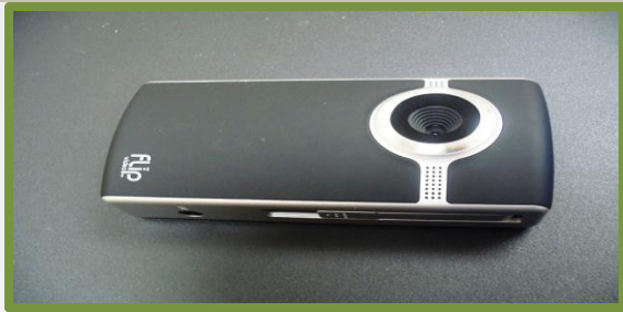
1. Here is our FlipVideo camera